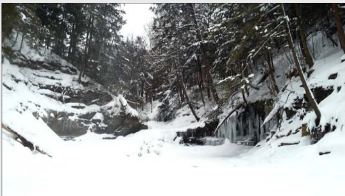
Looking up the gorge, February 3, by Concetta Schirra.