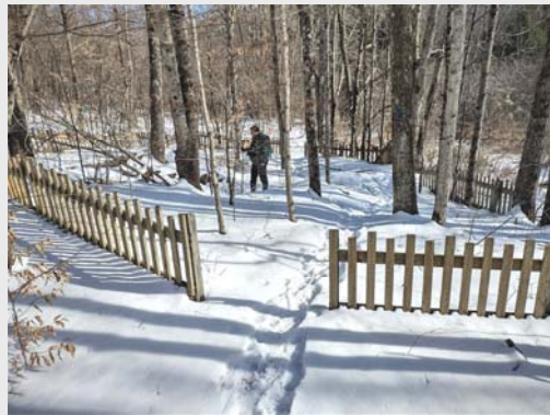
Left: Silver Creek Trail, near the intersection with the Meadow Trail. Above: The McCabe foundation, at the intersection of the Border and Wetland trails.