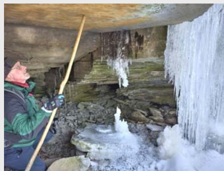
Above left: Behind this wall of ice is . . . (Above Right) this cavernous space.