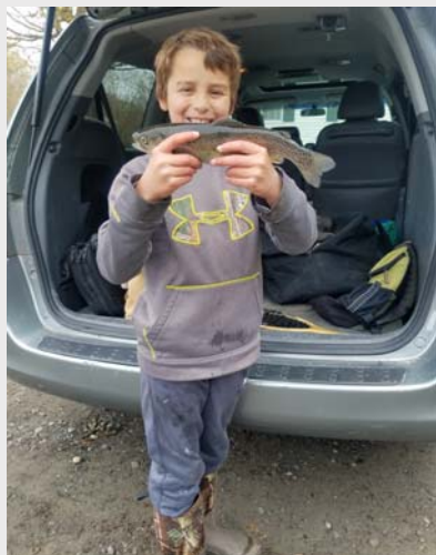
Come get yours!