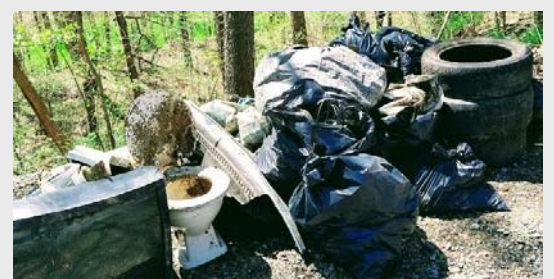
Last year's haul.

Annual Roadside Clean-Up. Sunday, May 1, 10 a.m. Help us clean the roadsides in and around the park. We work in teams. Bring a truck if you can. We provide bags, safety vests, and gloves. No fee.