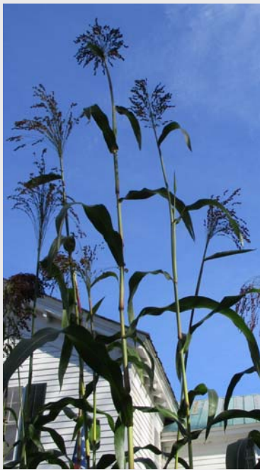
Broomcorn, in the 1850s Kitchen Garden behind the Wheaton House. This garden mirrors what the Wheatons might have grown for themselves. It is planned and maintained by volunteer Bruce Baessler and is different each year. See left for Bruce's plant description and a close-up of the seeds. It is harvest time in the garden.