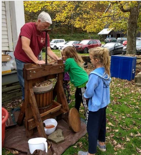
Making apple cider the old-fashioned way, with fresh apples and muscle power.