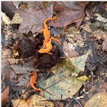
Red efts playing hide and seek.

When you do—speaking of autumn colors—be sure to wear some orange. Although the park is not heavily, or even modestly, hunted, 'tis the hunting season for, among other things, squirrel, ruffed grouse, cottontail rabbit, pheasant, bobwhite quail, woodchucks, as well as deer. And please be mindful of the extended seasons this year. If in doubt, check the PA Game Commission's website.